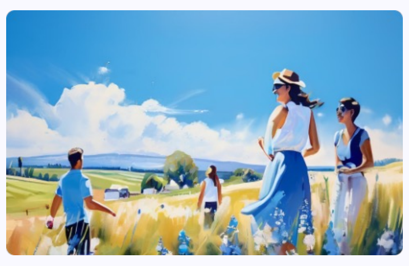
Amplify Local Voices

Focused group discussions allow geographers to delve deeper into complex topics, uncovering nuanced perspectives and contextual information that may be missed in other research methods.